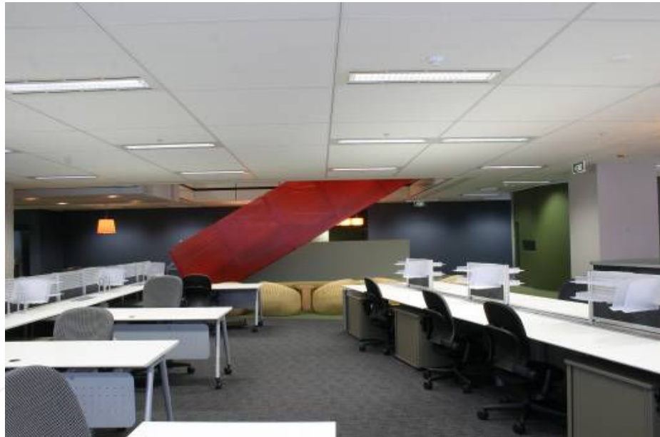
Solaton Enet 616 installed at Westpac Place, Sydney – 60,000m 2

Solaton Nashiji is a naturally textured tile manufactured to produce maximum sound absorption (NRC = 0.7~0.8) by its porous structure.