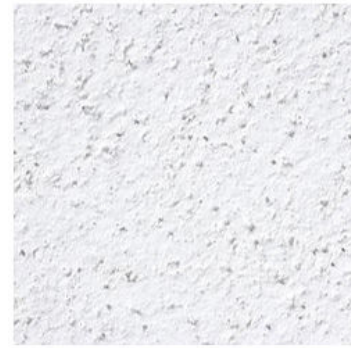
Nashiji Extra White